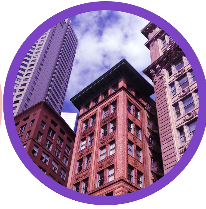
CONNECTING TO CULTURES