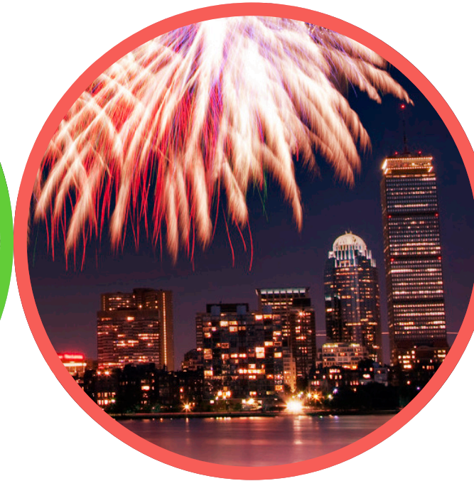
IGNITE THE NIGHT BEAUX ARTS BALL DECEMBER 31, 2016