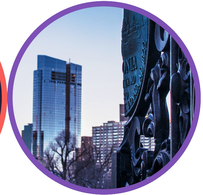
STRIKE THE MATCH CLOSING NIGHT PARTY JANUARY 1, 2017