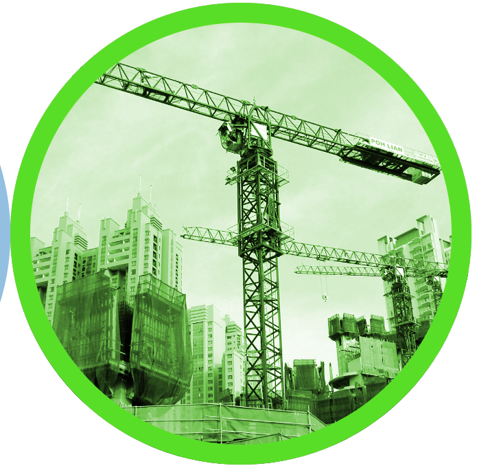
FABRICATING THE FUTURE