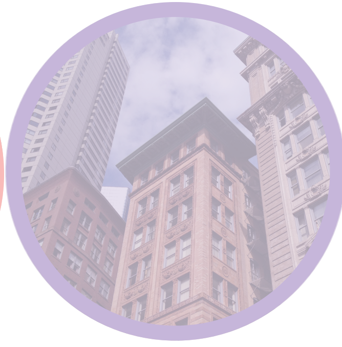
CONNECTING TO CULTURES