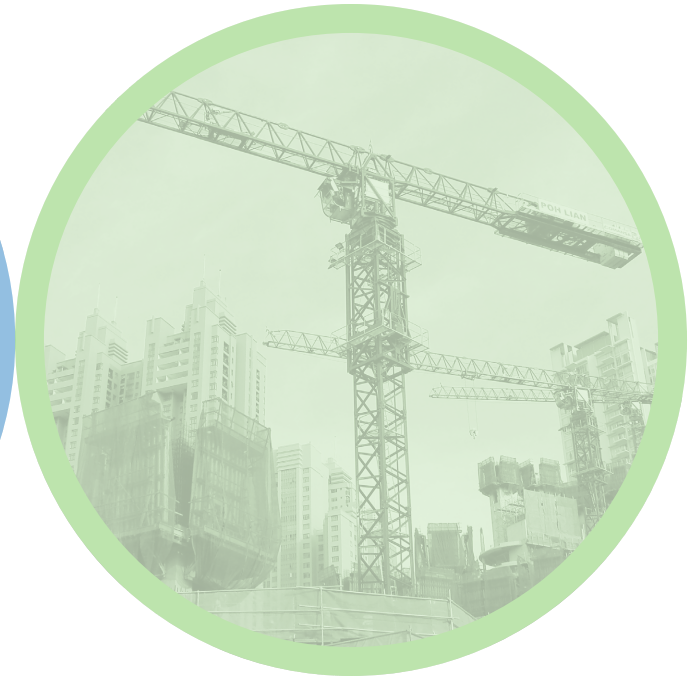
FABRICATING THE FUTURE

Some of today's most riveting architecture is found when a contemporary work of art touches a historic piece to complement it, support it, and bring it back to life. Culture, tradition, and history must be studied for that specific place and time for an architect to design an addition in a sensitive manner. Visit and learn about some of the most successful additions that either adapted to an existing structure or informed a foreign culture.