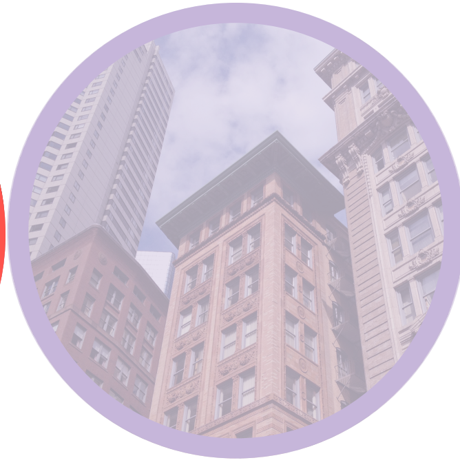
CONNECTING TO CULTURES