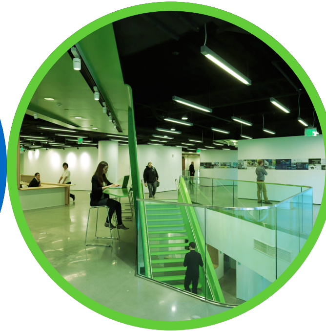
VANGUARDS OF SUCCESS HONORS & AWARDS CEREMONY DECEMBER 30, 2016