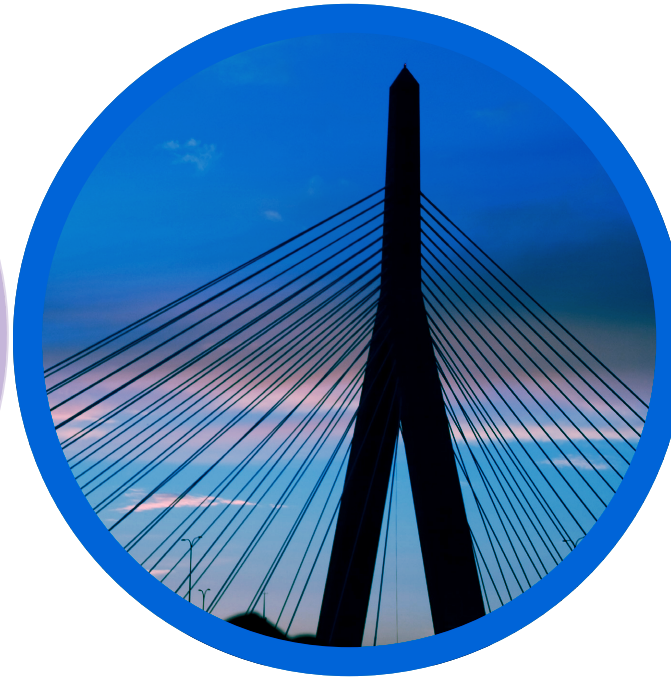
IN THE NOW