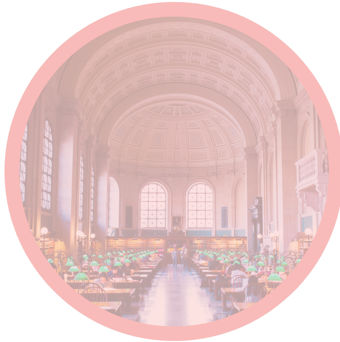
TRADITIONS IN DESIGN