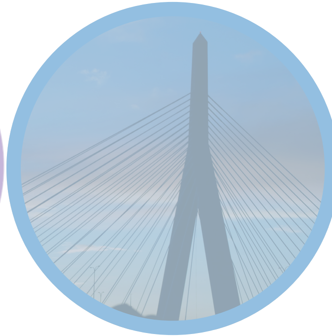
IN THE NOW