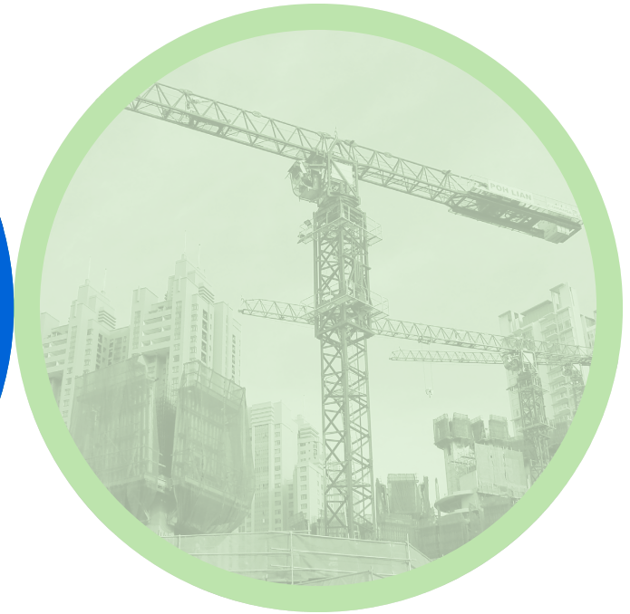
FABRICATING THE FUTURE

sponsored by: ENTERPRISE COMMUNITY PARTNERS