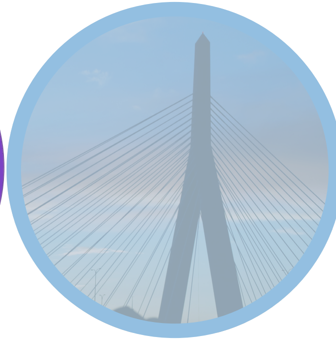
IN THE NOW