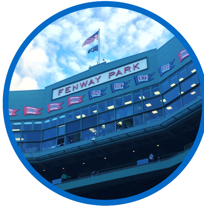
PIONEERS OF CHANGE 60TH ANNIVERSARY CELEBRATION DECEMBER 29, 2016