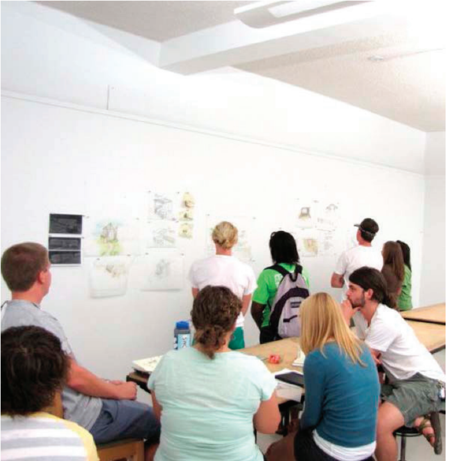
Design charrette to kick off a new project