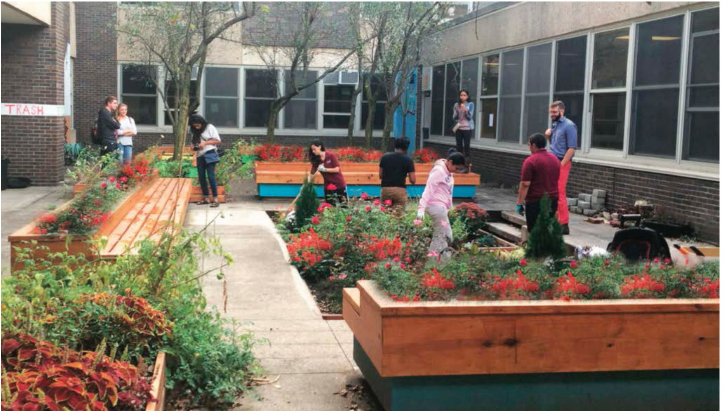
Volunteers working on courtyard project

(AIAS New Jersey Institute of Technology FBD Program)