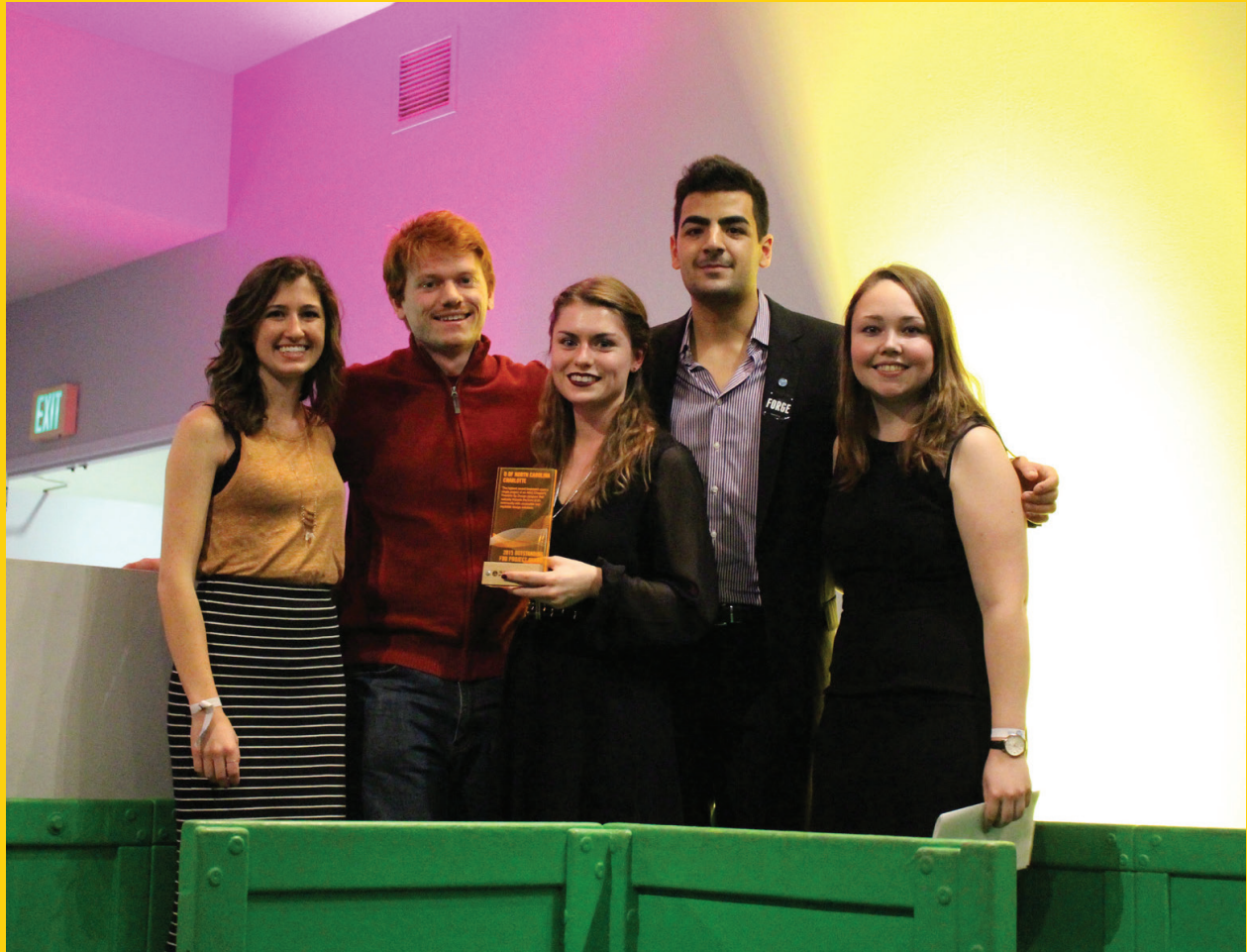
Freedom by Design Program and Project Awards awarded to University of North Carolina - Charlotte at FORUM 2015 in San Francisco, CA