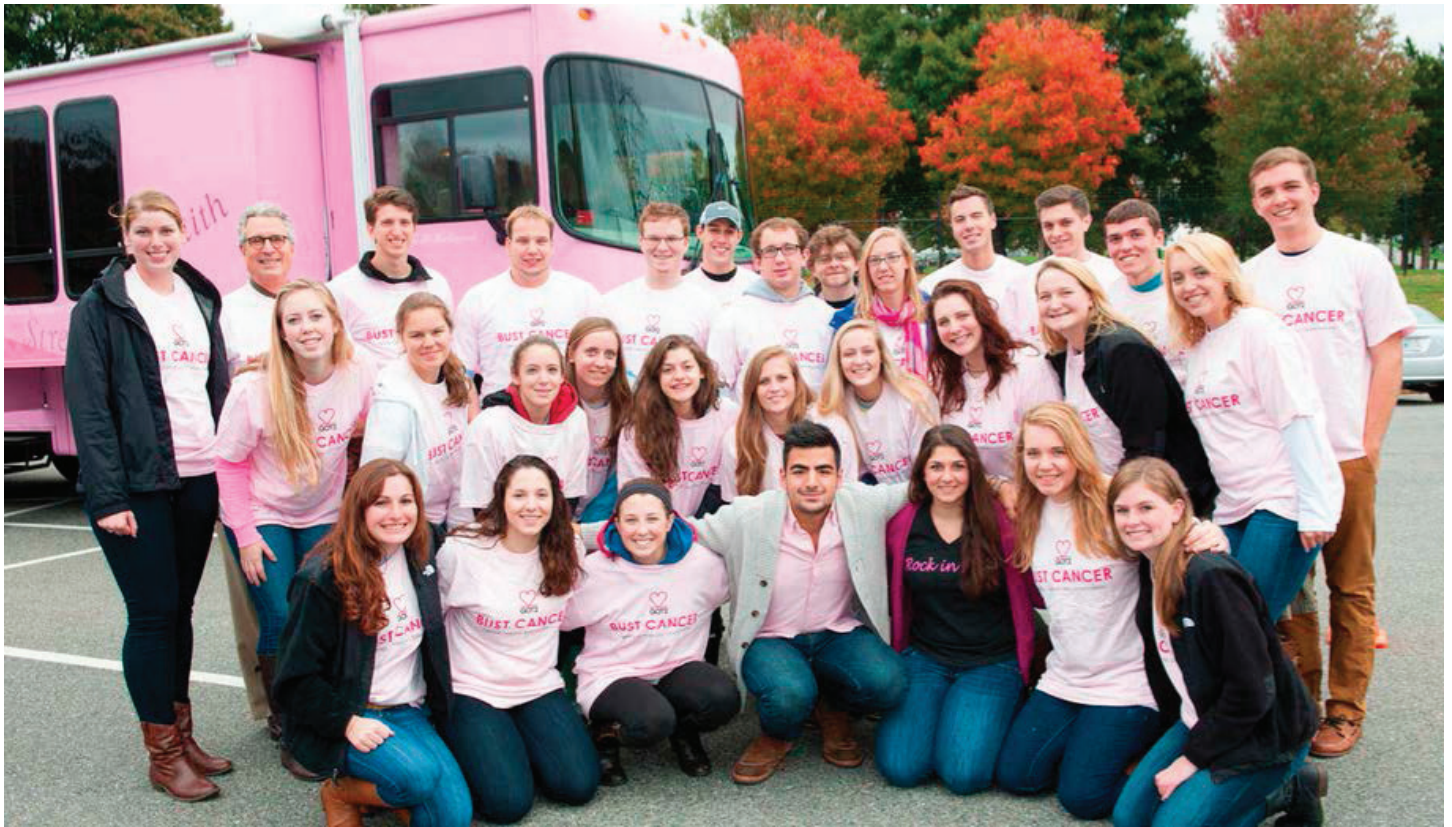
Garden of Hope volunteers

(AIAS Roger Williams University FBD Program)