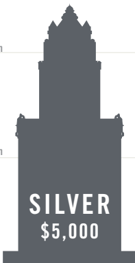
Woolworth Building (1913)