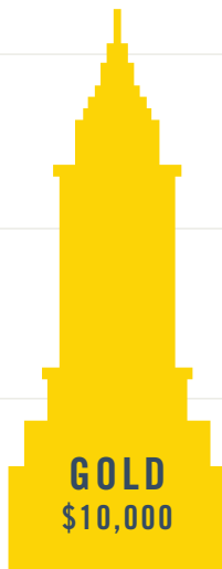
Chrysler Building (1930)