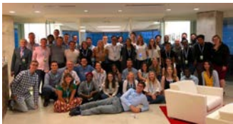
Midwest = Beautiful, Sexy, People