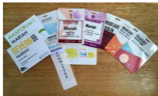
9 Conferences down and more to come!

2016 - 2017 AIAS Chapter President, University of Nebraska - Lincoln 2018 - 2019 AIAS Freedom By Design Director, University of Nebraska - Lincoln