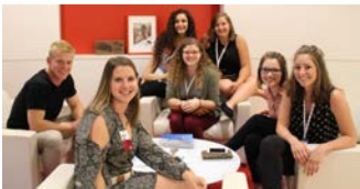
First Grassroots Conference