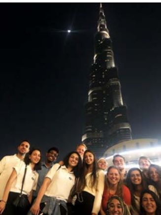
AIAS Int' Conference Dubai #ilookup